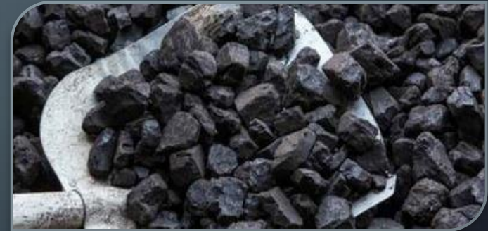
INDONESIAN COAL INDEX 1